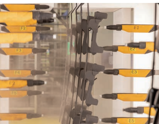
In the booth, 20 automatic spray guns follow the contours of the parts exactly.

The OptiSpray pump system guarantees a highly regular and carefully controlled powder output. This remains reliable even when long hoses are used, which is a major benefit, in particular in connec-