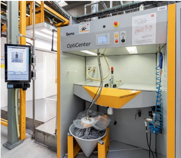
The powder centre with its application pumps supplies the automatic guns with powder.