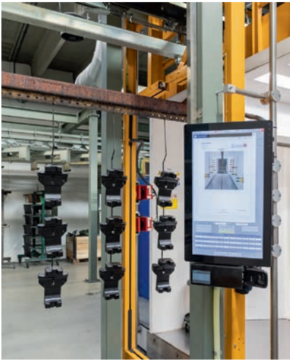
The layout of the guns and the coating parameters are shown on large screens.