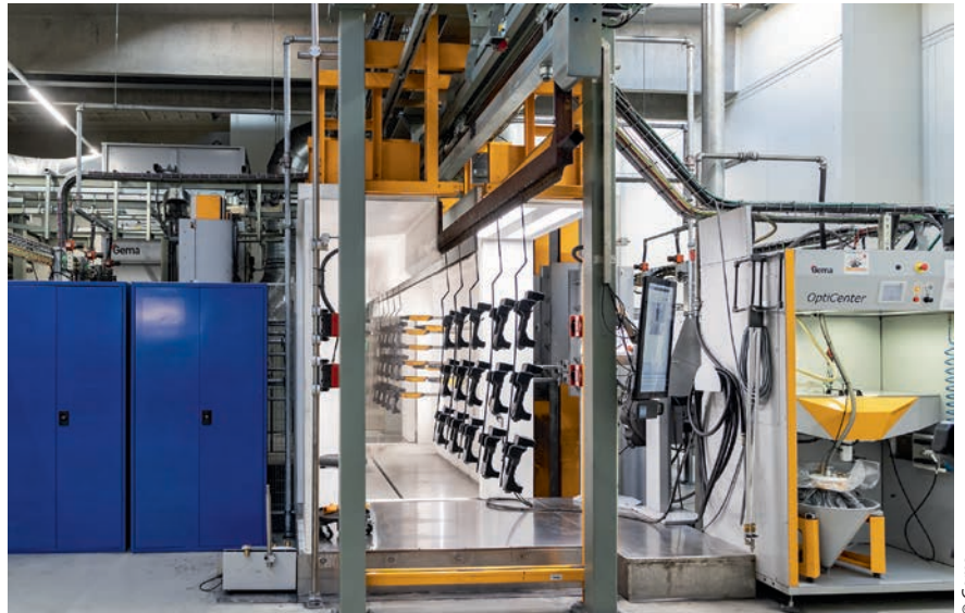
The powder coating shop at Birn A/S is compact and flexible.

tion with the individually positioned axes, and results in consistent and reproducible coating finishes.