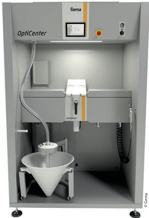
The new powder centre combines the powder feed, control unit and electrostatic system in a very small space.

An integrated monitoring system automatically identifies