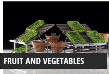
FRUIT AND VEGETABLES